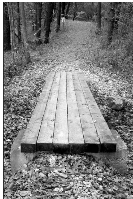
Inset above left is a photo showing remnants of one of the two rotting footbridges on our nature trails that were replaced in spring 2013 by the crew of Steve Pike, Skip Weeks, and Tom Ayres. At left is the new bridge in place, with the robust 4x6s tied together from below and secured to the existing concrete piers. This bridge is located not far into the woods at the northeast corner of the meadow behind the Weeks Brick House. At right is the other new bridge the crew wrangled into place at the beginning of the trail that leads from the parking lot on Tide Mill Road. (If this kind of work is just your kind of non-profit volunteer board service, by all means contact us by phone, e-mail, or postal mail!)

Skip had is trusty Chevy pickup truck, which we loaded with the heavy 16-foot planks. Skip then very skillfully backed down to the first bridge, so we had very minimal moving of the planks into position on the concrete piers. Steve, the true professional that he is, had all the right tools on hand, so we were able to quickly fasten the planks together, which was much easier than I expected. For the second bridge, the planks were loaded in Skip's truck. He then